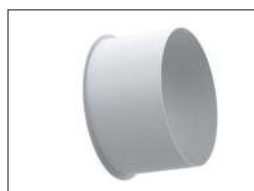
Full Anti-Glare Shield