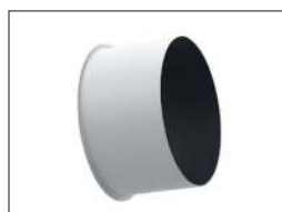
Full Anti-Glare Shield