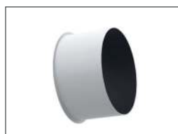
Full Anti-Glare Shield