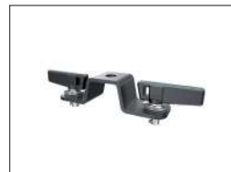
Omega Bracket ST