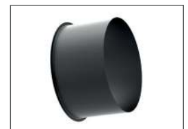
Full Anti Glare Shield