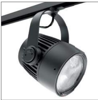
T.SHOW mini FC