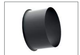
Full Anti Glare Shield