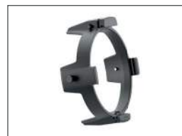
Safety Free Accessory Holder