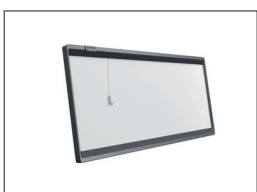
Smart Glass Filter