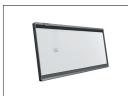
Elliptical Horizontal Filter