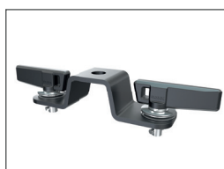
Omega Bracket ST